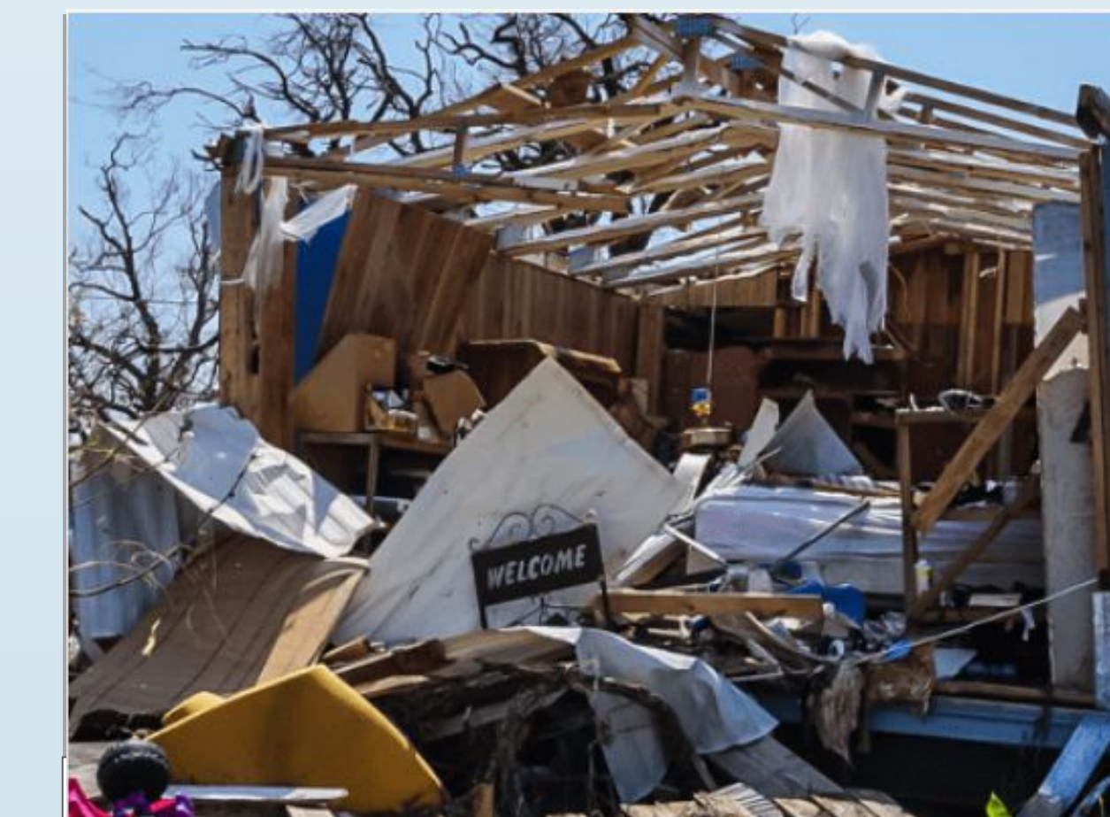
Social Vulnerability and Disasters