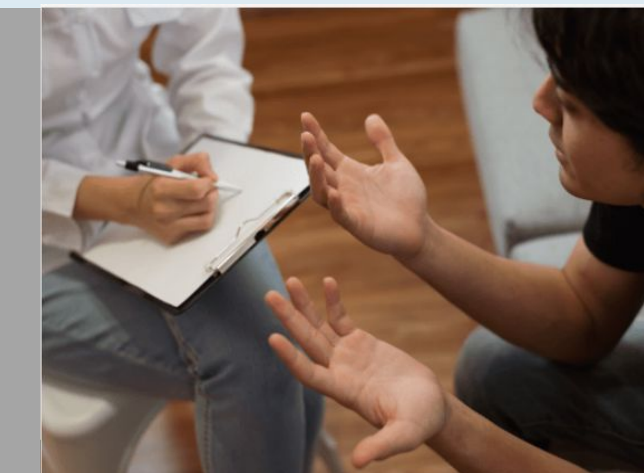
Disaster Mental Health