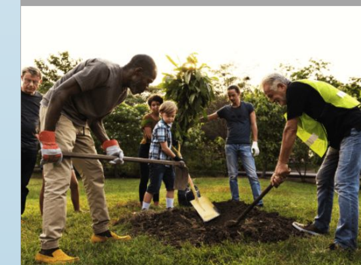
Cultural Competence in Hazards and Disaster Research