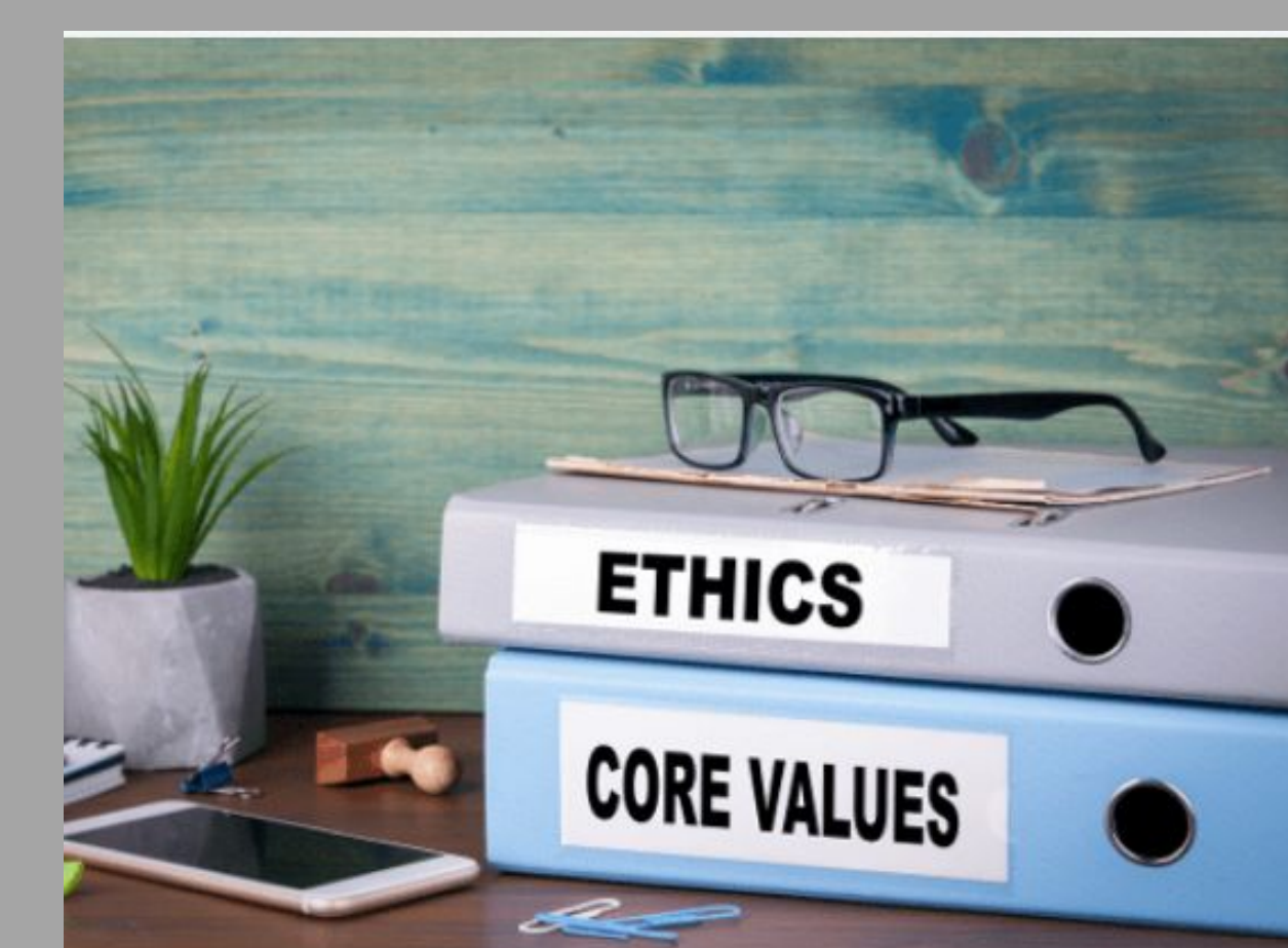
Institutional Review Board (IRB) Procedures and Extreme Events Research