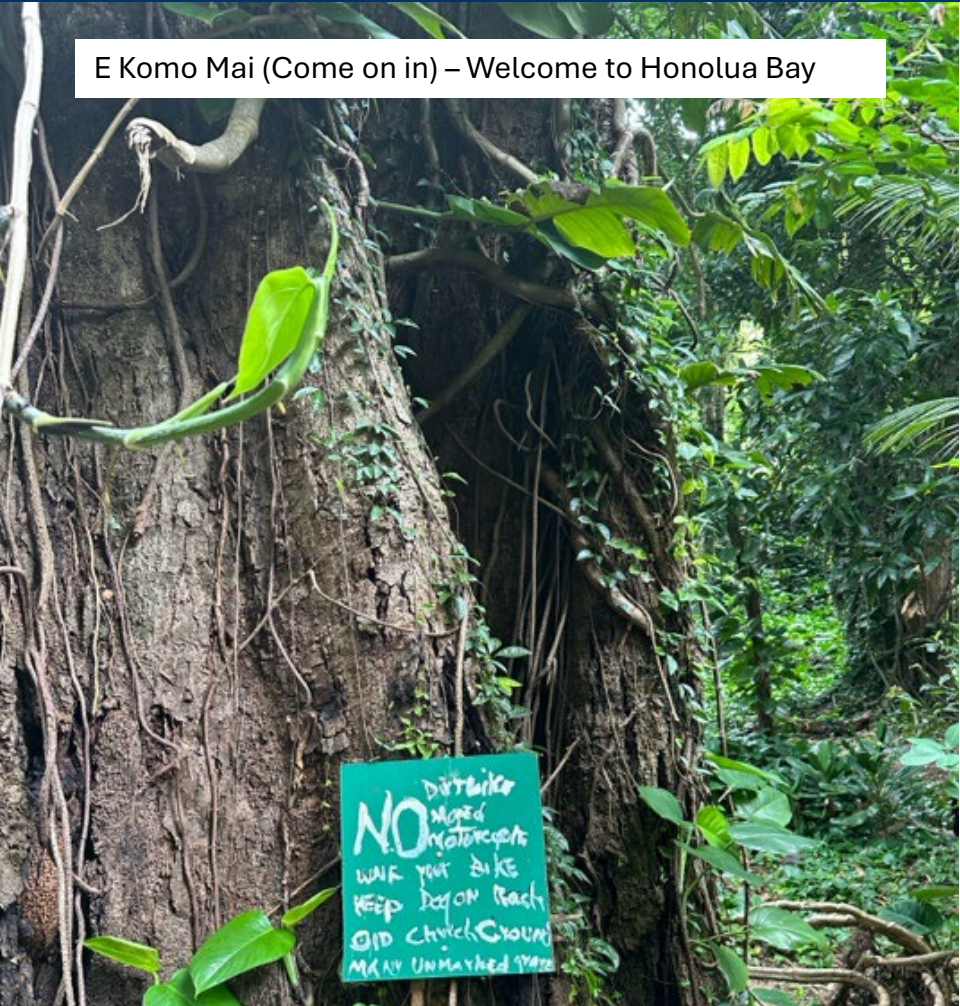
E Komo Mai (Come on in) – Welcome to Honolua Bay

NO dirt bike moped motorcycles WALK YOUR BIKE KEEP DOGS ON LEASH OLD CHURCH GROUND MANY UNMARKED GRAVES